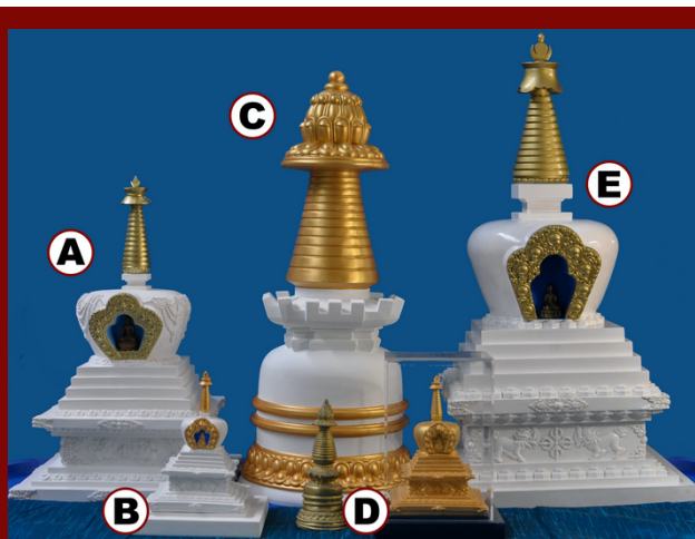
Stupas available for placement in the gardens or home use.