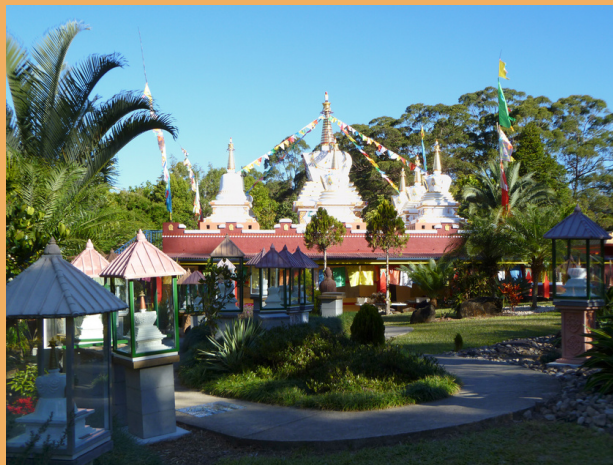
Gardens with Stupas