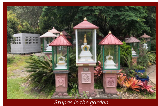
Stupas in the garden

Prayer wheels can be sponsored for any positive or purposeful reason. They do not contain ashes.