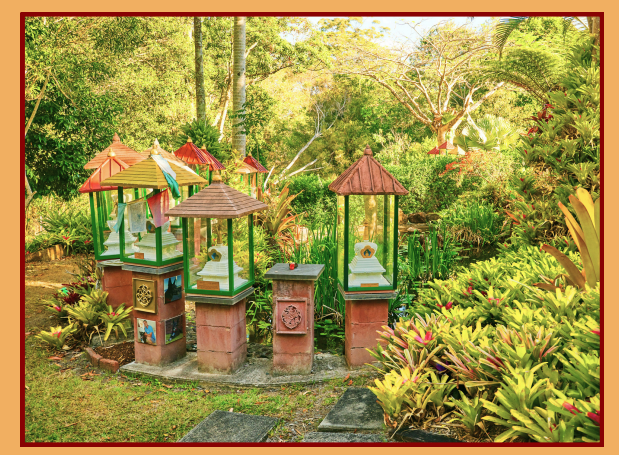
Gardens with Stupas

The Garden of Enlightenment is an interfaithbased project and is open to all people, all religions and all pets!