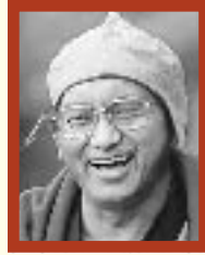
Kyabje Zopa Rinpoche